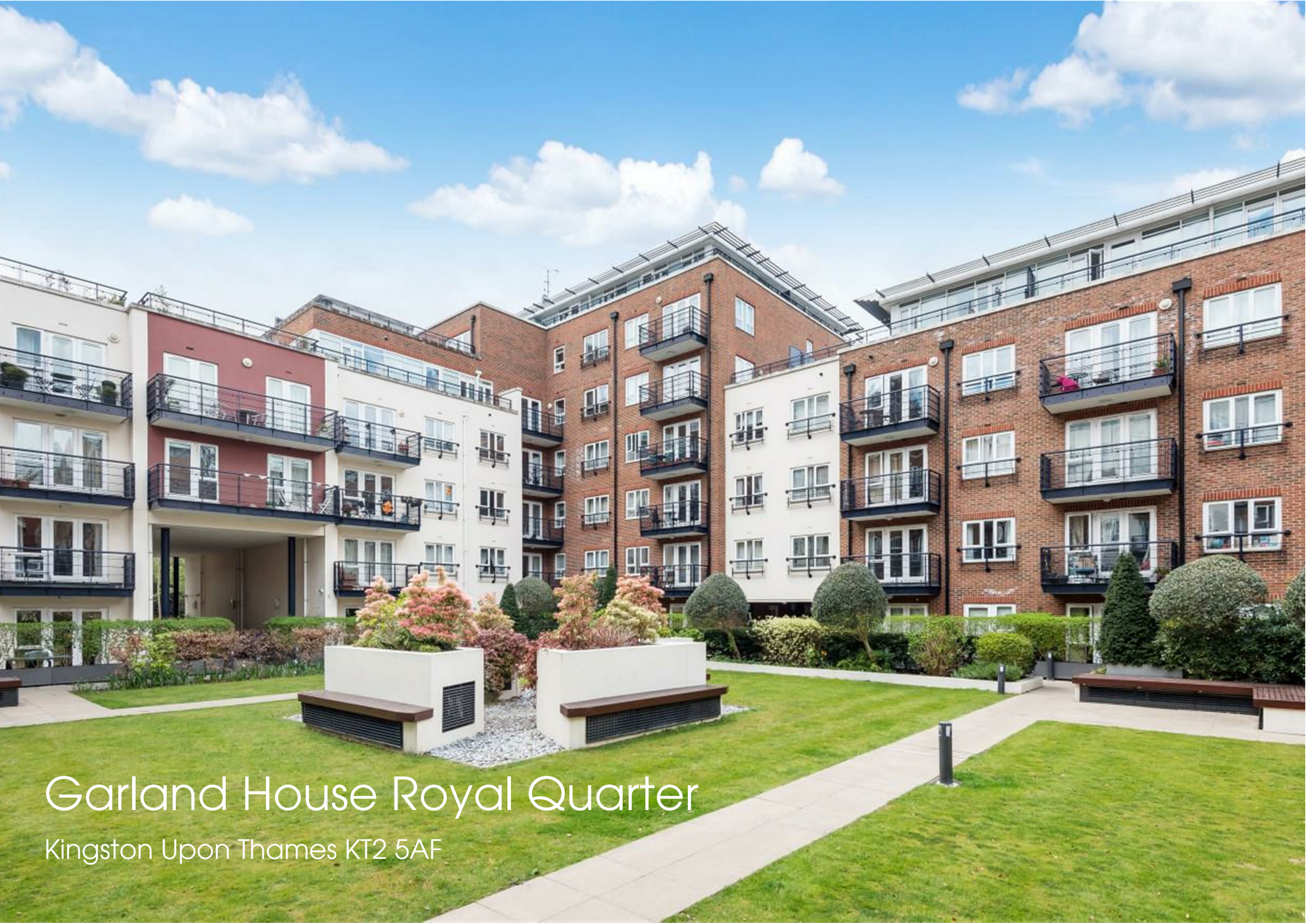
Garland House Royal Quarter Kingston Upon Thames KT2 5AF